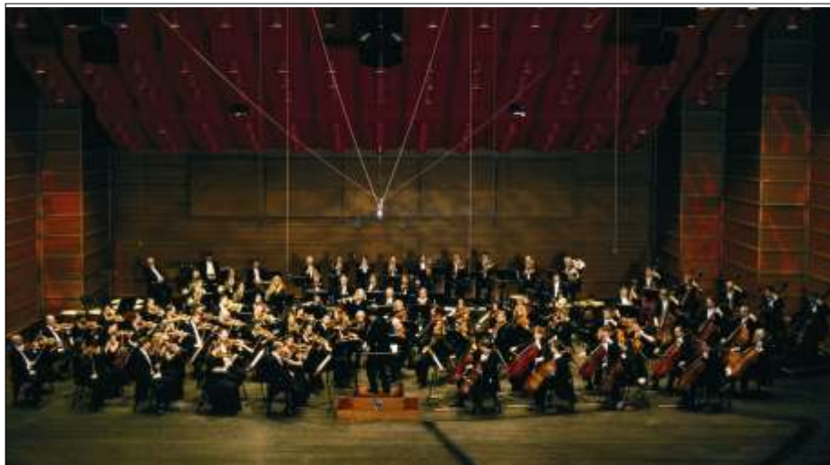
95 musicians comprise The Bergen Philharmonic Orchestra