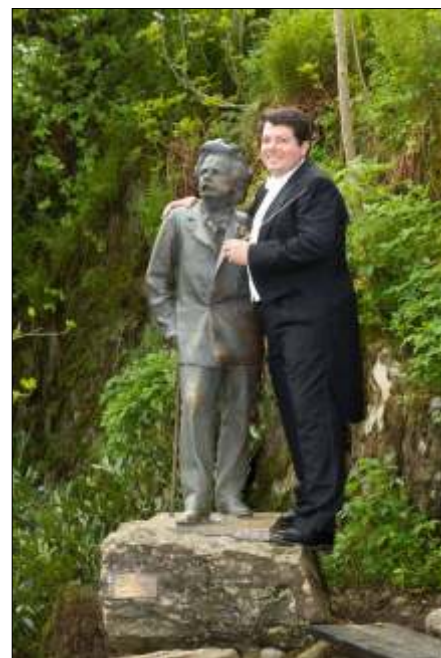
Maestro Litton with Grieg statue at Troidhaugen