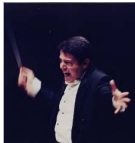
It has been said that the contact between the conductor and the orchestra is exceptional.