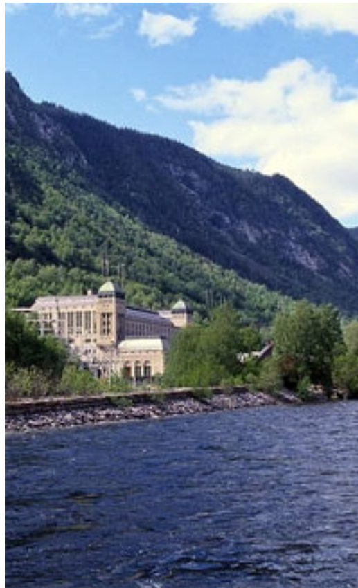
SOURCE OF POWER: The waterfalls at Rjukan, with its monumental Såheim power station, were the foundation for Hydro's industrial development in Norway some 100 years ago.

"The waterfalls at Rjukan have represented Hydro's most reliable and predictable source of power through our 105-year history. We