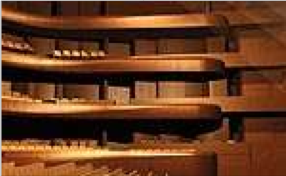
The main performance auditorium has 1,350 seats and is designed in a classical form with a horseshoe-type plan and a high ceiling.