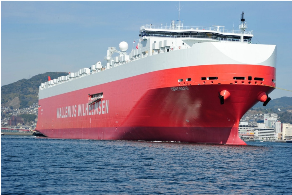
The new Mark V class is the largest and most sophisticated roll-on roll-off carrier ever built. The first vessel, MV Tønsberg, is now launched into operation.

The Wilh. Wilhelmsen group has launched its 150th anniversary vessel, MV Tønsberg, into operation. The Mark V class is the most sophisticated vessel ever built in the roll-on roll-off segment.